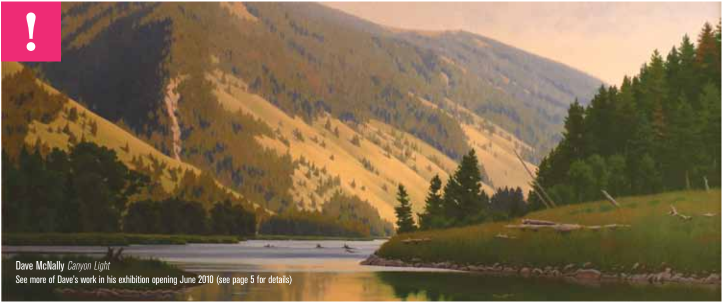
Dave McNally Canyon Light See more of Dave's work in his exhibition opening June 2010 (see page 5 for details)